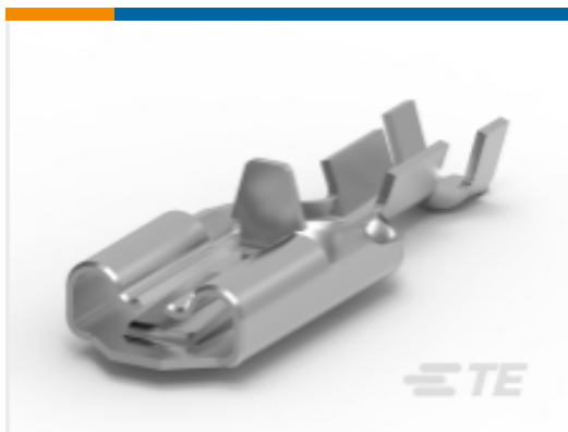
TE Part # 2238156-1 POS LOCK 250 Rec, MKII, 22-18 TPBR