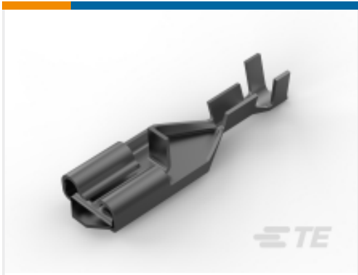
TE Part # 170327-1 250 PL MKII REC. 22-18AWG PTBR