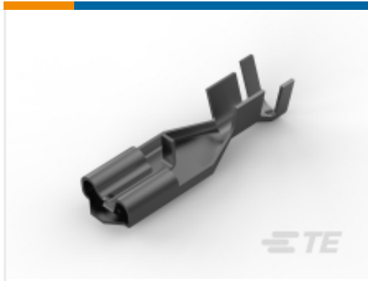
TE Part # 170329-1 250 PL MKII REC. 15-10AWG PTBR