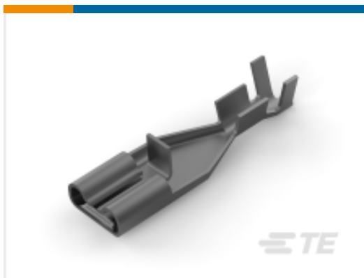
TE Part # 170334-1 205 PL MII,REC.,18-14,PTBR