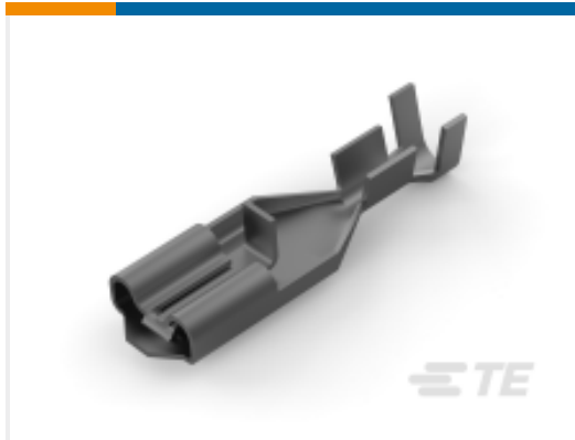
TE Part # 170328-1 250 PL MKII REC. 18-14AWG PTBR