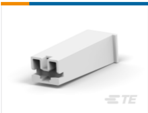
TE Part # 3-172076-1 POSITIVE LOCK 250 HOUSING RECEPTACLE